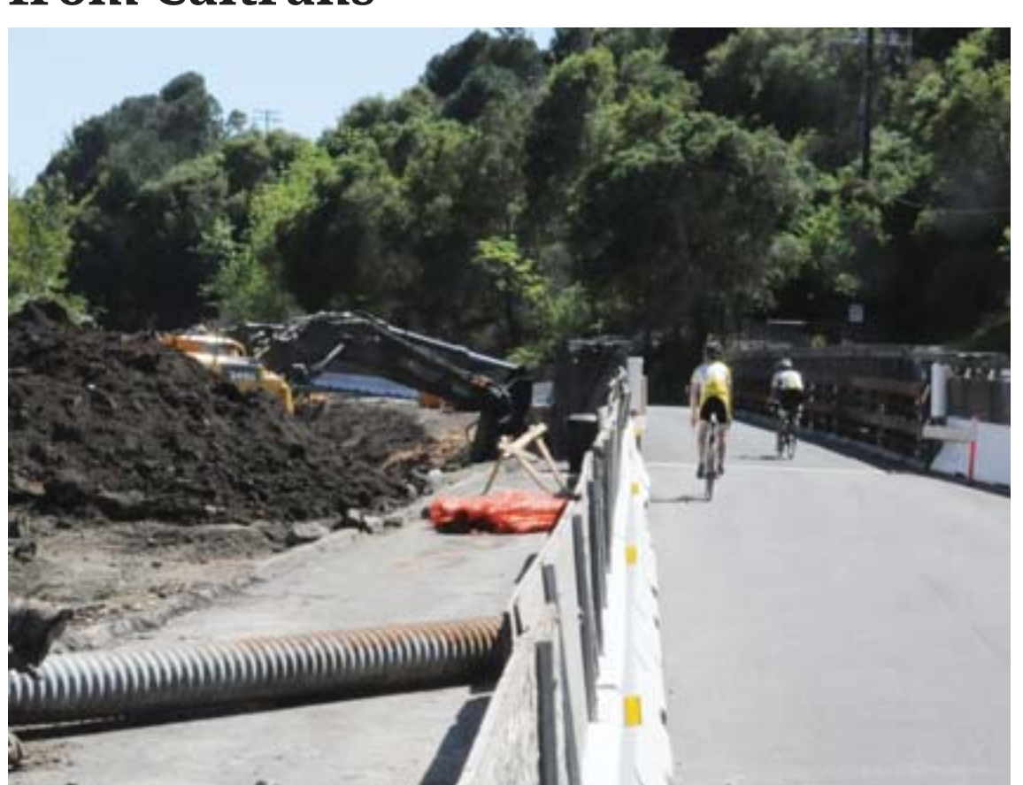
Canyon Bridge work